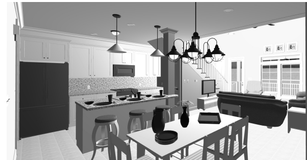
KITCHEN / DINING PERSPECTIVE

2nd FLOOR PLAN LIVING AREA 974 sq ft TOTAL 1399 SF