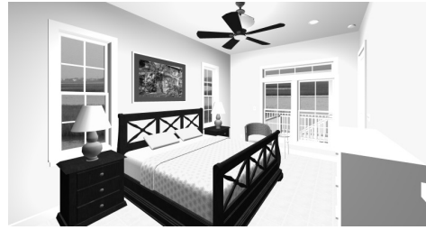
MASTER BR PERSPECTIVE