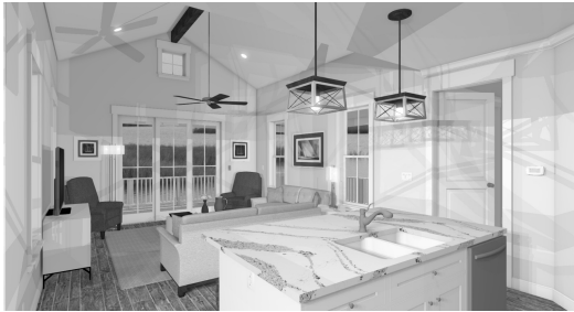
KITCHEN & LIVING