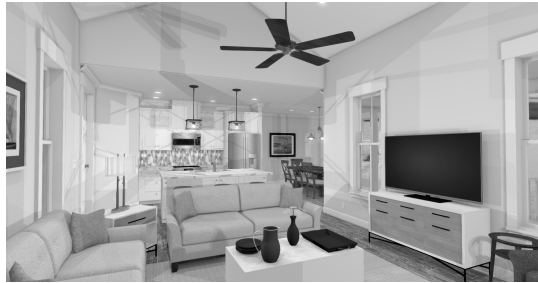
LIVING / KITCHEN / DINING