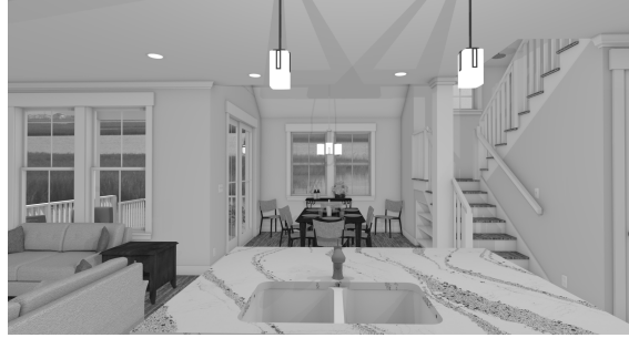
KITCHEN TO DINING