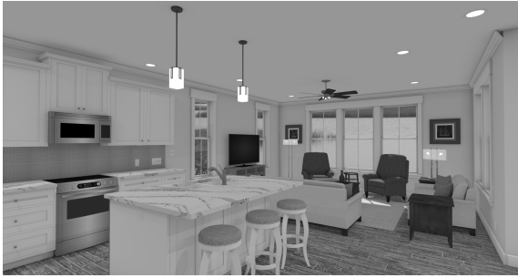
KITCHEN TO LIVING