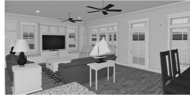
LIVING / DINING