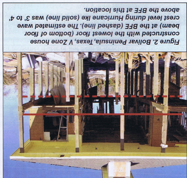
Figure 2. Bolivar Peninsula, Texas, V Zone house constructed with the lowest floor (bottom of floor beam) at the BFE (dashed line). The estimated wave crest level during Hurricane Ike (solid line) was 3' to 4' above the BFE at this location.

Bolivar flood damage in V zone demonstrates why "Freeboard" is now recommended.